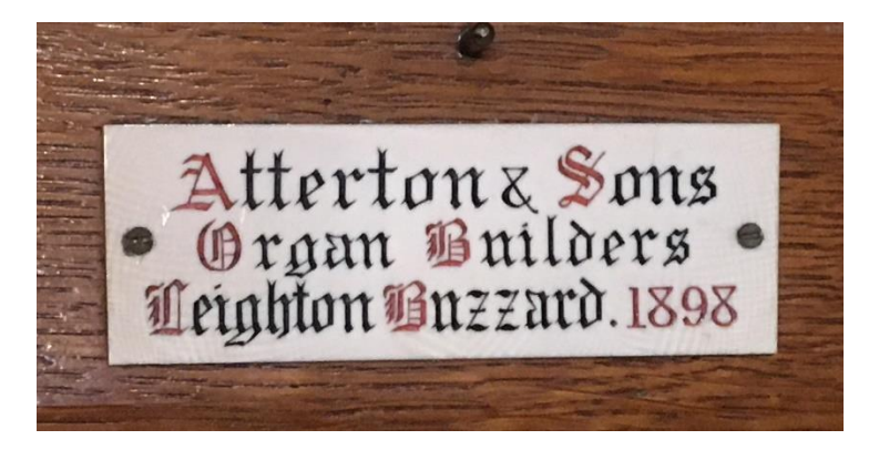
Case and name plate

Below: front of organ with panelling removed, and pallet box cover, showing pallets, green plastic eye inserts from 1985, etc. The white strip on the front of the soundboard is the masking tape. The pallets are faced with two layers of thick leather. The surface of the soundboard under the pallets is clean, as if it was planed flat in 1985